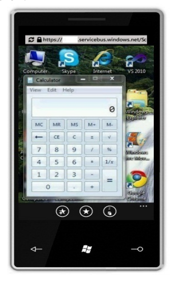
Fig 1.Screen access in Windows Phone

So far application was tested with Google chrome, Internet Explorer (IE), android, Windows Phone 8, iPhone, Firefox.